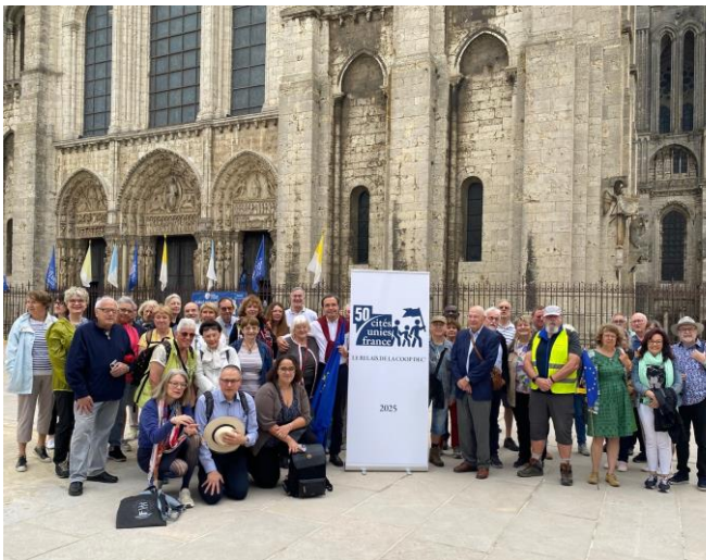
Point de Départ

Chartres, le 31 mai 2025 – Le "Joli Mai de l'Europe" a trouvé son point d'orgue ce samedi matin à Chartres, avec la très attendue "Promenade des Jumelages". Organisée par Chartres International dans le cadre du Relais de la Coopération Décentralisée de Cités Unies France, cette balade a offert aux participants une immersion unique dans l'histoire des liens qui unissent la cité eurélienne au reste du monde.