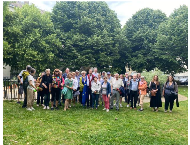
Place de Chichester

Dès 9h15, un groupe de participants enthousiaste s'est rassemblé devant la Conciergerie, sur l'esplanade de la cathédrale. Curieux et passionnés, ils étaient prêts pour cette "Promenade des Jumelages" qui les a conduits à travers les rues et jardins de Chartres, chacun portant le nom d'une ville jumelle. De la rue de Bethléem (Palestine) au paisible Jardin de Sakurai (Japon), en passant par les Places de Chichester (Angleterre), Spire (Allemagne), Évora (Portugal) et Ravenne (Italie), chaque étape a été l'occasion de découvrir les histoires et anecdotes derrière ces partenariats internationaux.