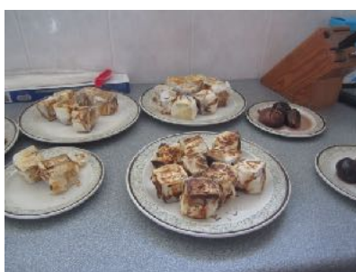
Here's the menu we served.

Goats Cheese & Spiced Bread Parcels with Rocket Leaves Duck Breast, sauté potatoes and raspberries with red wine jus Figs with Pecan Nuts Pyrenees Style